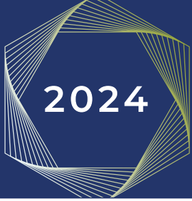
Table Top Exhibitor Contract